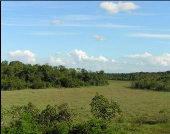
A savannah in the Maracá Ecological Reserve, a 110,000 riverine island