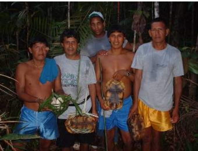
Tortoises are a popular food item among indigenous peoples.

We ran transects at both sites and after six months, we had captured and released 56 red-footed and 21 yellow-footed tortoises. Although we found no significant difference in tortoise density between the two sites, we did observe that the hunted site at Mangueira was composed of more juveniles and females than the unhunted site at Maracá. One potential explanation is that males tend to be more active than females during the breeding season, moving more often and over greater distances, thus increasing their risk of detection by hunters. (Cont. on following page)