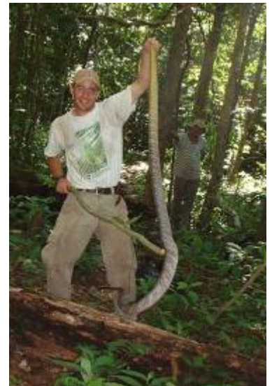
The author often made time to pursue other reptiles when the opportunity arose.

I worked at Maracá Ecological Reserve, a 110,000 ha riverine island, formed by the branching of the Rio Uraricoera in northern Brazil. The study site is situated on the northeastern edge of the Amazon basin. Maracá has been protected since 1978 and had minimal human occupation before this time, so it supports healthy populations of characteristic fauna for this region including tapirs, collared and white-lipped peccaries, jaguars, pumas, and giant anteaters. The hunted site, Mangueira Macuxi Indigenous Reserve, is a 4, 238 ha indigenous reserve located about 10 km to the south of Maracá, where about 65 Macuxi Amerindians reside. Hunting is the primary source of protein at Mangueira, although they do raise some livestock such as cattle, pigs, and chickens.