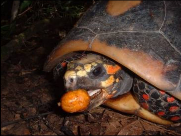
Over the course of the study, tortoises were recorded ingesting nearly 20 species of seeds.

Over the course of the study, we also recorded nearly 20 species of seeds ingested by tortoises, ranging in size from about 1 mm for tiny fig seeds to over 5 cm for a large palm seed, and most seed species were viable and abundant in fecal clumps. Some seeds took nearly four weeks to pass through tortoises' digestive tracts, similar to retention times recorded for gopher tortoises and box turtles. During that same time, tortoises traveled hundreds of meters, dispersing some seeds beyond one kilometer from the parent tree and over a wide variety of habitat types, thus increasing the likelihood seeds will arrive at a suitable site for germination. Thus, it appears that tortoises are likely important components of tropical ecosystems, effectively dispersing seeds of numerous species of plants.