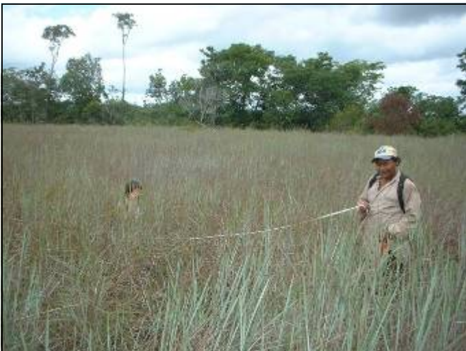
Measuring a tortoise's path in the grassy savannah

Hunting is one of the most serious threats facing wildlife in the neotropics and potentially occurs in nearly 99 % of the 3.7 km 2 Brazilian Amazon.