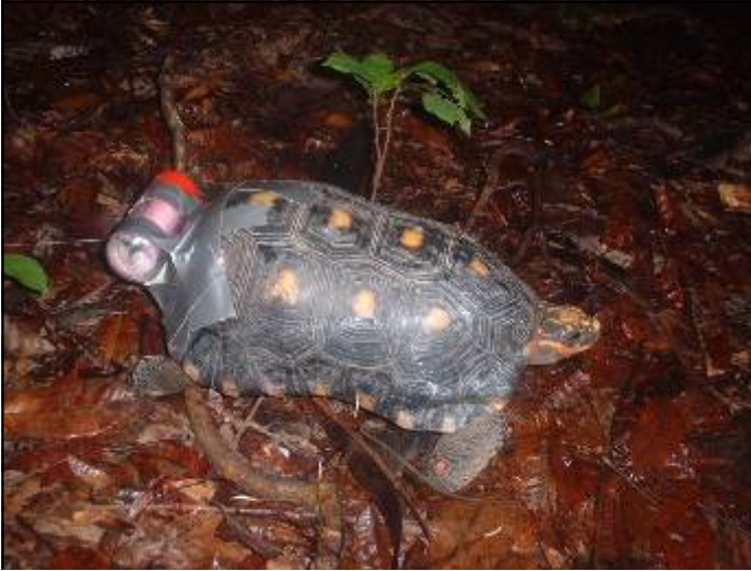
A tortoise equipped with thread trailer device designed to monitor movements in Brazil.

The pink polyester thread seemed to go on forever, seemingly through the worst habitat possible, at least for the two sweaty humans trying to follow and map the route with a compass and meter tape. The thread trail led us from a dense patch of lowland palm swamp, where we had to meticulously weave our way through a gauntlet of spine-covered palm trees, into a flooded savanna, where clumps of cutting grass had to be carefully pulled apart to track the thread, meter by meter, as it wove its way through the grassy labyrinth. The trail crossed the 200 m savanna clearing and entered a small patch of forest where it continued to meander through vine falls, beneath a fruiting Genipa tree, and finally vanished into a giant armadillo, Priodontes maximus , burrow nearly a kilometer away from where we had begun.