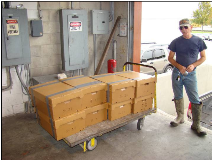
Commercial fisherman delivering 8 cases of medium-sized Florida softshell turtles ( Apalone ferox) to Tampa International Airport for shipment to Los Angeles.

Efforts to ban the harvest of freshwater turtles in Florida have increased in November. A group of biologists met with the Office of the Governor and a letter from 32 leading turtle scientists was presented to Governor Crist urging him to act on behalf of Florida's wild turtles. A letter writing campaign was initiated by the Florida Turtle Conservation Trust (FTCT) and other conservation NGOs with considerable success. A Florida Fish and Wildlife Conservation Commission (FWC) biologist reported that collectively the governor's office and the state wildlife agency received over 3,000 pro-turtle letters and only 22 pro-harvest from the public. We believe this clearly speaks for how the citizens of Florida feel about this conservation issue. Finally, a meeting to address this issue was held by the FWC and the large turnout included at least nine non-FWC turtle biologists. An excellent case was made for complete harvest closure.