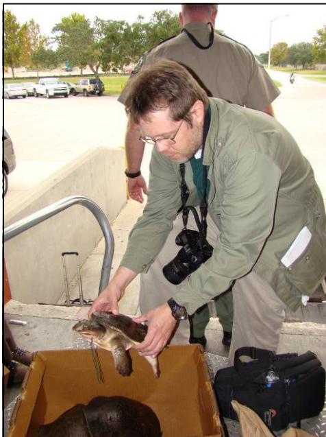
Florida Fish and Wildlife Conservation Commission biologist inspecting a shipment of Florida softshell turtles ( Apalone ferox) at Tampa International Airport.