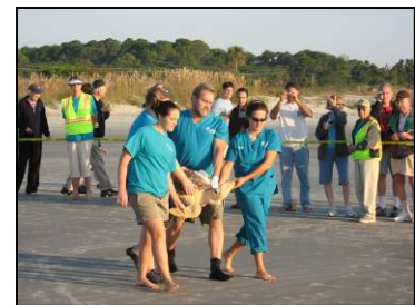
Images associated with the 2008 GTC meeting in October at Jekyll Island, Georgia.