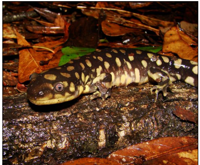
A tiger salamander, Ambystoma tigrinum, could have been the species observed within the tortoise burrow.